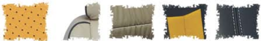
PERFORATION PIPING GATHERED PANELS FLAT PANELS CONTRAST STITCH