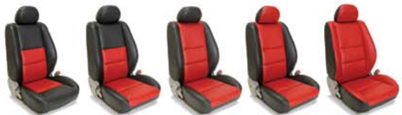
INSERT COMBO BODY CENTER FACES