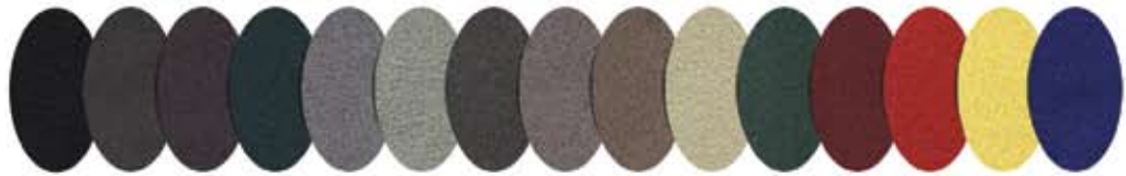
ONYX DK. SLATE DK.MIST GREY STEEL LT. SLATE MUSHROOM DK. TAUPE MED. TAUPE SANDSTONE SANDALWOOD MOSS MERLOT RUBY SULPHUR ROYAL