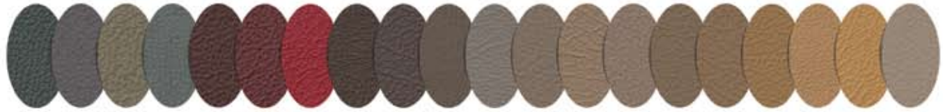
WILLOW SAGE OLIVE JADE MAROON MEDIUM RED RED DK. BROWN DRIFTWOOD TAUPE FAWN DESERT NUTMEG LT.MOCHA BEIGE TEAK CAMEL TAN DOESKIN ADOBE