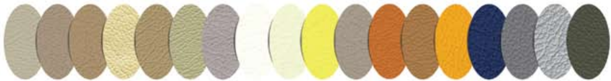
IVORY SANDSTONE BISQUE VANILLA CREAM BEACH DOVE GREY PEARL BONE SUNRISE SHALE ORANGE AUTUMN MAIZE PACIFIC ICE GREY SILVER PEBBLE