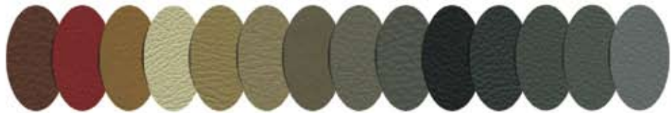
AMARETTO MARASCHINO PALOMINO SHELL LAITE WHEAT CAPPUCCINO TERRA GRANITE MIDNIGHT STORM FLANNEL STERLING PEWTER