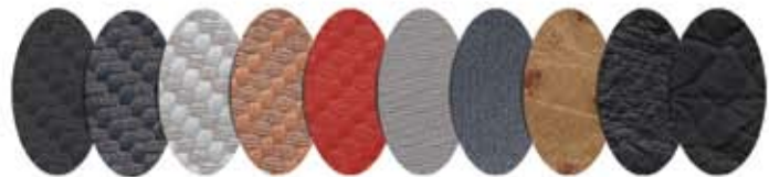
CARBON SHADOW CARBON BULLET CARBON NICKEL CARBON COPPER CARBON DRAGON MACHINED SILVER MACHINED GUNMETAL RUSSIE IRON ALUSSO BLACK EVERBRAIDS

Katzkin utilizes the finest materials to produce interiors that are unmatched in quality, fit and durability that are backed by an industry leading 3 year/36,000 mile warranty.