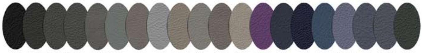
BLACK DK.GRAPHITE GRAPHITE CHARCOAL LT. GREY STONE SMOKE ASH PLATINUM GREY SLATE PUDDY PURPLE NAVY BLUE SKY BLUE CADET BLUE LAPIS MIST GREY FOREST