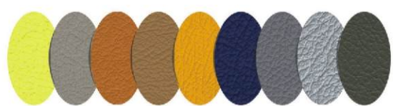
SUNRISE SHALE ORANGE AUTUMN MAIZE PACIFIC ICE GREY SILVER PEBBLE