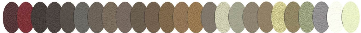
MEDIUM RED RED DK. BROWN DRIFTWOOD TAUPE FAUN DESERT NUTMEG LT.MOCHA BEIGE TEAK CAMEL TAN DOFSKIN ADOBE BAMBOO IVORY SANDSTONE BISQUE VANILLA CREAM BEACH DOME GREY PEARL BONE