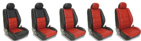
INSERT COMBO BODY CENTER FACES