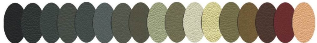
MIDNIGHT STORM FLANNEL GRANITE STERLING PENNER TERRA CAPPUCCINO SHELL WHEAT WICKER MACCHIATO LATTE PILODINO AMARETTO MARASCHINO BUTTERSCHOTCH

The softest, most supple leather ever offered for automotive use.