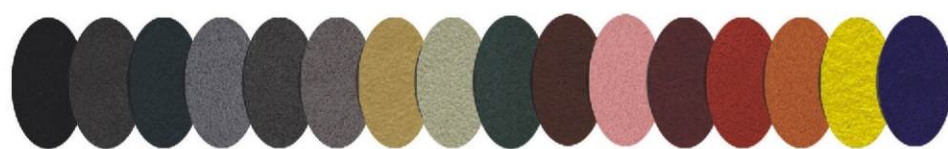
RAVEN DK. SLATE STEEL FOG DK. TAUPE MED. TAUPE TAWNY SANDALWOOD MOSS CHOCOLATE PINK CRANBERRY SCARLET CARROT SULPHUR ROYAL

A synthetic suede that is a perfect 2-tone complement to Katzkin standard leathers.