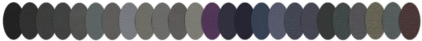
BLACK DK.GRAPHITE GRAPHITE CHARCOAL LT.GREY STONE SMOKE ASH PLATINUM GREY SLATE PLUDY PURPLE NAVY BLUE SKY BLUE CADET BLUE LAPIS JUST GREY FOREST WILLOW SAGE OLIVE JADE MAROON