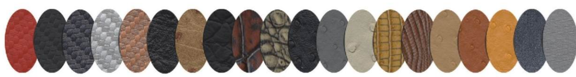
CARBON COUNSON CARBON SANDSON CARBON BUBBLE CARBON NICKEL CARBON COPPER AUSSIE BLACK AUSSIE TAN EVERGLADES BISOPHNE BAYOU AUSSIE NIGHT AUSSIE CLOUD AUSSIE CLAY LIZARD TAN LIZARD MOCHA AUSSIE PEAN AUSSIE CANYON AUSSIE SADDLE MATCHED GUNMETAL MATCHED SILVER

Cowhide with simulated Ostrich or Crocodile and various unique synthetics.