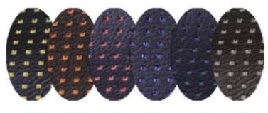
YELLOW ORANGE RED BLUE CHARCOAL FLINT

Black leather with square perforation available in six View-Thru colors.