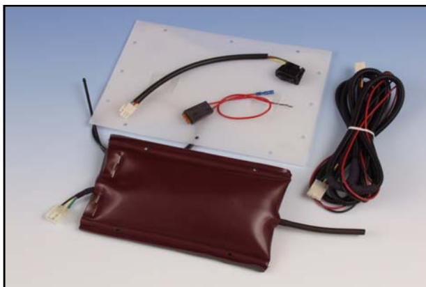
Model #250-1454 Front Mount